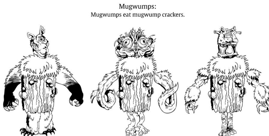
Fig. 2. Examples of images of Mugwumps (distractor category members) presented to participants in Experiment 2 . In this case, Mugwumps can be identified by their common, trunk-like, torso.

When they chose to proceed, participants entered a training phase, where they were first told which creature was approaching, (e.g., “Look, here comes a Bogwomble”), next they saw the image of a creature, and finally they selected which food to give the creature. They were given feedback on the task and were prompted to correct errors until they selected the correct food (e.g., “The creature won’t eat that. It’s still hungry! What will you feed it now?”). In this phase, participants saw seven Bogwomblers, seven Queezlekins, and two Mugwumps,